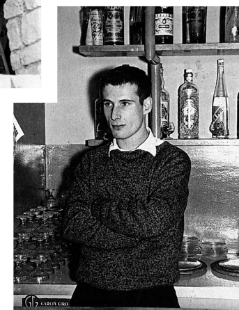
It was inaugurated as a hotel in 1955.